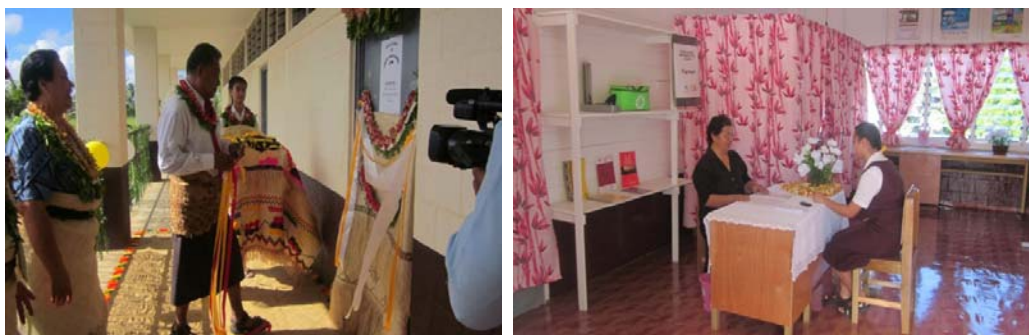
Figures 3 and 4: Opening of the Vava'u school-based clinic and clinic in session

School-based clinics are funded through the HIV and STI Response Fund.