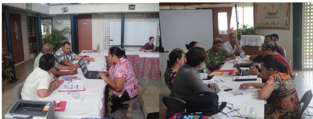
Image 4 and 5: Government and civil society completing National Commitment and Policy Instruments, Nuku'alofa, February 2012