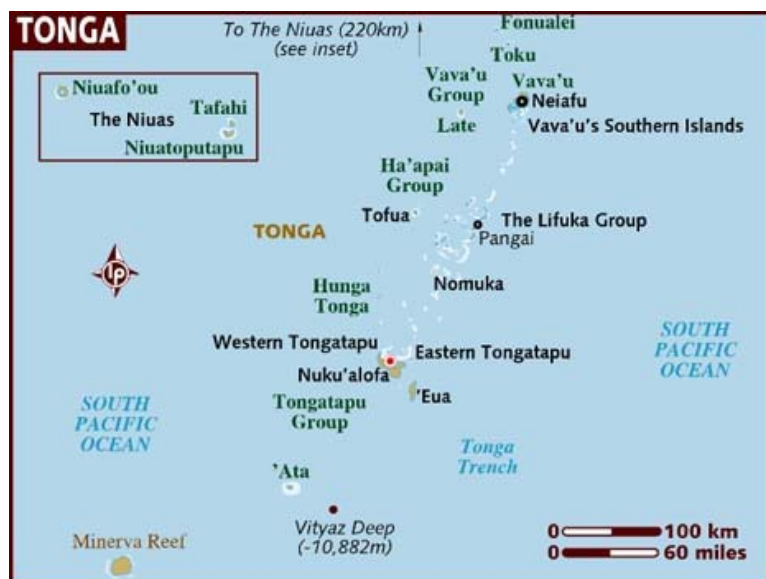
Figure 2: Map of Tonga

A member of the Commonwealth of Nations, Tonga is the only Pacific country to retain its monarch without interruptions, and has been led by a constitutional monarch since the early 1800s. Since 2009, the democracy movement in Tonga has led to Parliamentary reform, with greater representation of commoners in Parliament.