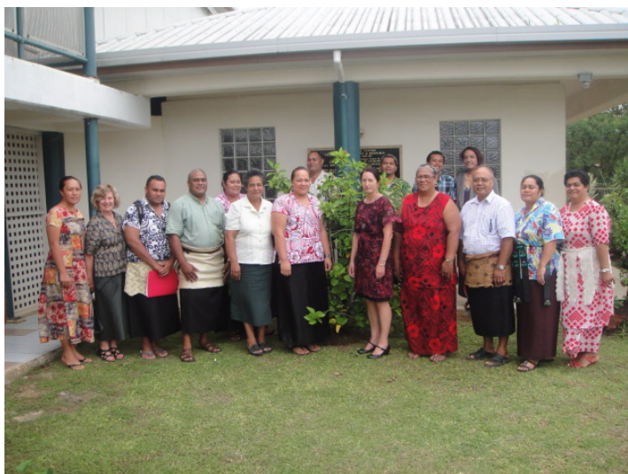
Figure 1: Validation meeting, Nuku'alofa, February 2012

The Country Report was prepared in a participatory manner and engaged a range of stakeholders, including government agencies, civil society and development partners and people living with HIV. Stakeholders attended meetings, filled in the National Commitments and Policy Instrument (NCPI) and attended a data validation workshop in Nuku'alofa on 28 February 2012. A list of participants consulted in preparing this report is appended.